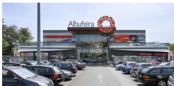
ALBUFEIRASHOPPING & CC CONTINENTE PORTIMÃO Sold for Sonae Sierra