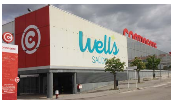
PROJECT FOUR 2.0 Acquired for Aberdeen Asset Managers