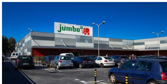
FOCUS RETAIL PARK, PORTO Sold for Temprano Capital Partners