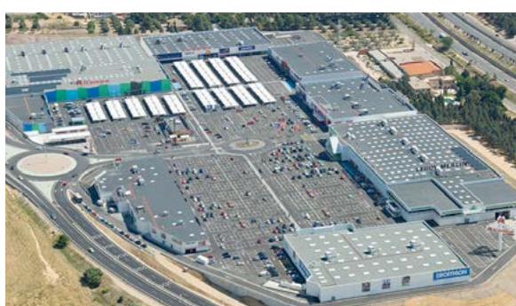
ABADIA RETAIL PARK, TOLEDO Sold for Rockspring PIM