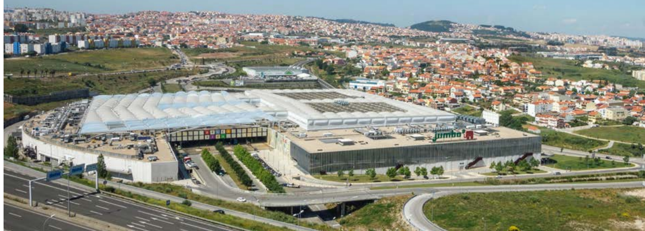
DOLCE VITA TEJO, LISBON RPE represented the Vendors

€600m of retail transactions completed in 2017 in 8 transactions