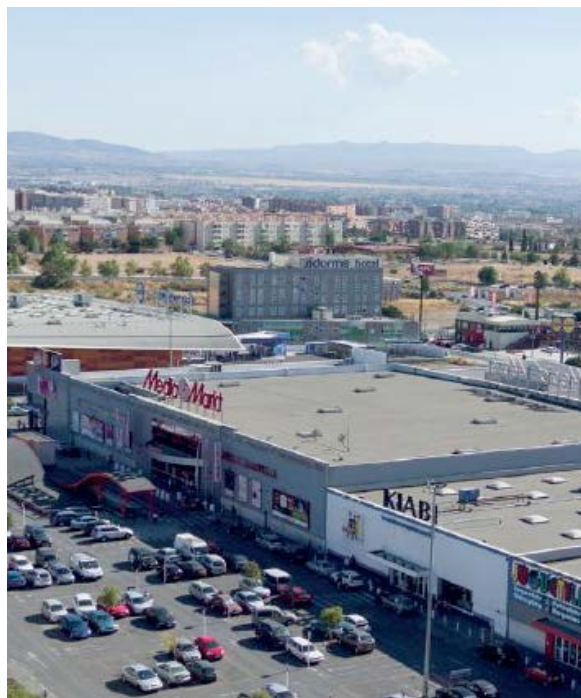
PROJECT LONDON RETAIL PARK PORTFOLIO Acquired for Vukile