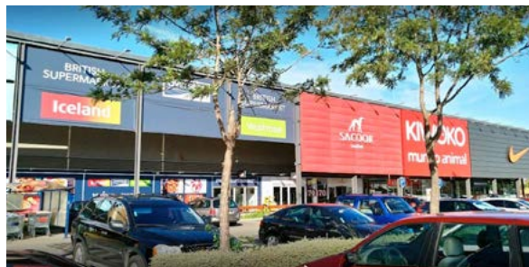
ALBUFEIRA RETAIL PARK Acquired for Iberia Coop CBREGIP & Sonae