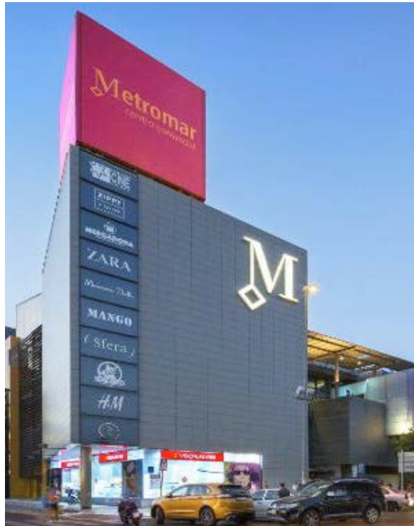
METROMAR SHOPPING CENTRE, SEVILLE Acquired for Schroders