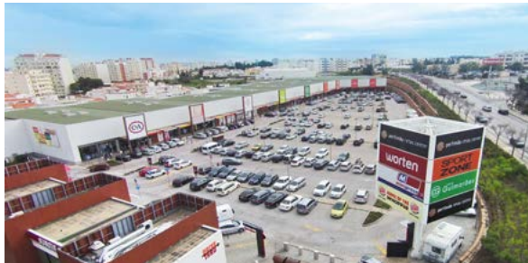
PORTIMÃO RETAIL CENTER Sold for ARES/Redevco